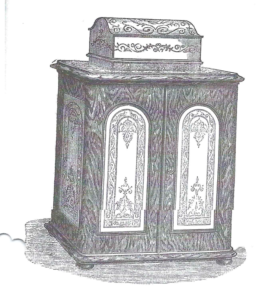
Figure 2-100. Howe (Stockwell Brothers) one of several cabinet styles (O/5).

Figure 2-99. Howe (Stockwell Brothers). This stand had a cover which unfolded to create more work area (F/2).